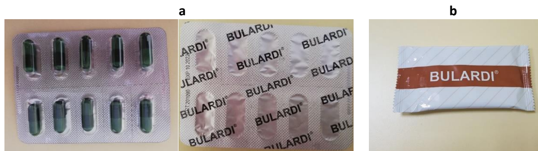
Figure 2. Photographs of a) blister with sample capsules (top and bottom); b) flow-pack bag with sample blisters (for samples 3 and 4)

All phases of production of capsules and blisters are performed in strictly controlled ambient conditions: 22 \pm 2 °C temperature and 30 \pm 5 % humidity. Using the described production procedures, samples were prepared for analysis. A Bulardi blister with ten capsules each as well as a flow pack bag are shown in Figure 2.