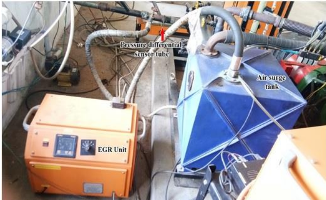
Figure S2. The EGR unit.